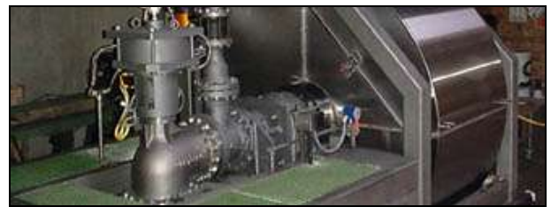
Odenberg part no. P0101192

The Tantaline valve spindles are still in use and no failures have been reported to date.